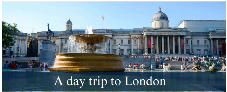
A day trip to London